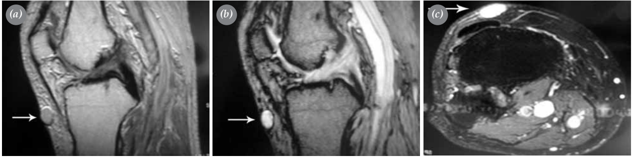
Fig. 1. Magnetic resonance scans of the mass located anterior to the patellar tendon: (a) T1A-weighted and (b) T2-weighted images showing hypointensity and hyperintensity, respectively. (c) Axial scan.

4-cm anterior longitudinal incision in the lower border of the left patella and a well-circumscribed mass was excised from the subcutaneous tissue (Fig. 2). The histopathologic diagnosis was reported as glomangioma consisting of glomus cells with uniform, oval-round shaped nuclei, large eosinophilic cytoplasm, and vascular structures (Fig. 3).