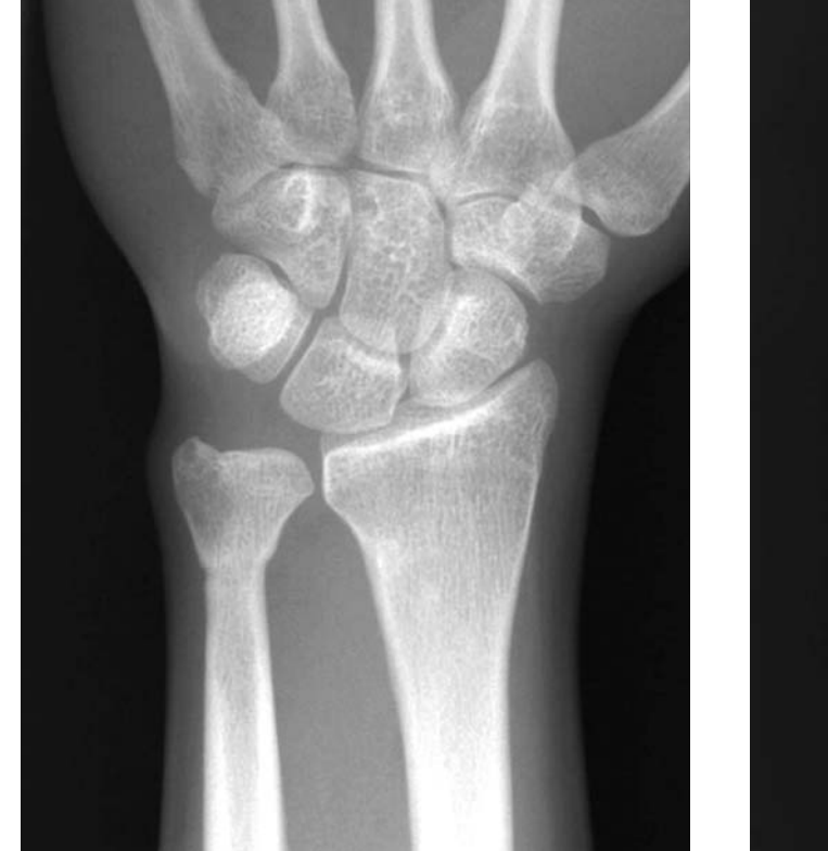
Fig. 6. X-ray shows that the graft formed an indentation in the ulna.

Posttraumatic loss of integrity of these structures leads to instability, presenting with decreased grip power and mechanical symptoms.<sup>[9]</sup> The ulnar head is displaced proximally during supination and distally during pronation. This is more evident when there is a length discrepancy between the radius and ulna, also termed ulnar variance.<sup>[6]</sup> Instability of the DRUJ may be seen in conjunction with radial head fractures, radius diaphysis fractures, distal ulnar dislocations (Galeazzi) or comminuted fractures of the radial head. Instabilities of the DRUJ often go unnoticed in acute trauma.<sup>[5,11,12]</sup> If they are suspected, appropriate radiological studies will enable early diagnosis.<sup>[5]</sup> Although isolated DRUJ instability is uncommon, dorsal and volar dislocation may occur after falls with the forearm in hyperpronation and hypersupina-