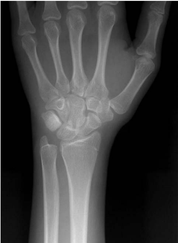
Fig. 2. Increased distance between the radius and ulna in anteroposterior X-ray.

ma, and patients present later with significant pain that interferes with daily activities, with decreased grip strength and limitation of wrist movement. This study evaluated short-term results in patients with DRUJ instability treated with ligament reconstruction as described by Fulkerson and Watson.