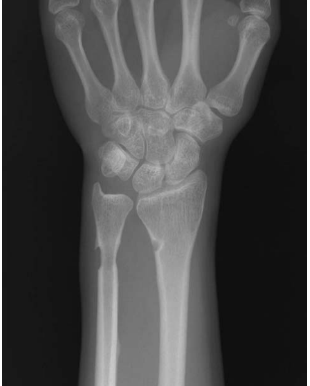
Fig. 7. X-ray of a patient with a more proximal location of the graft and the indentation in the ulna.