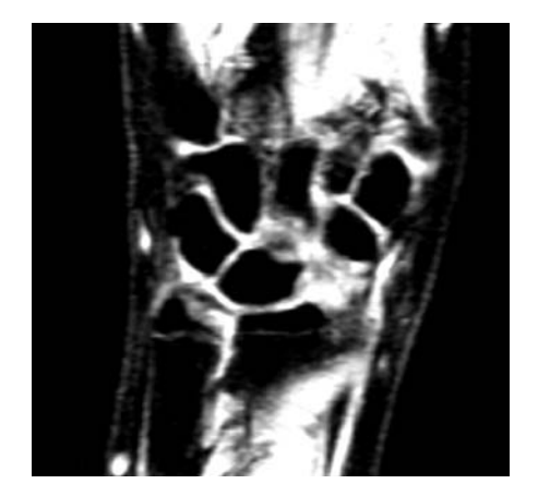
Fig. 4. MRI shows increased joint fluid in the DRUJ.

In the distal radius, a semicylindrically shaped sigmoid notch articulates with the convex ulnar head. It is, however, very shallow and therefore contributes very little to the stability of the DRUJ. The ulnar head is separated from the carpal bones by the TFCC.<sup>[2-7]</sup> The normal ulnar head is inclined 20°