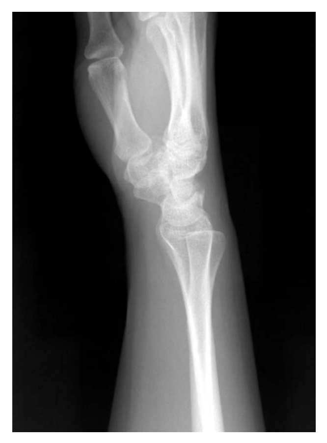
Fig. 3. Lateral X-ray shows dorsal subluxation of the ulna.

The proximal and distal radioulnar joints work together in the axial rotation of the forearm, which normally has a range of motion of more than 150 degrees. This movement involves all structures in the forearm and is enabled proximally by rotation of the radial head on the immobile ulna, and distally by the rotation of the ulnar head on the radius. The ulnar head is important in the more proximal transmission of axial loads applied to the radius.<sup>[1,6]</sup>