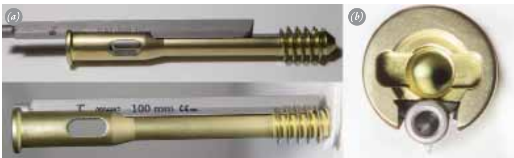
Fig. 2. The placement of antirotator blade on the groove of lag screw is seen from the AP (a) and lateral (b) aspects. [Color figure can be viewed in the online issue, which is available at www.aott.org.tr ]

In group A, the fixation was achieved with 3 parallel CS of 85 mm length and 6.5 mm width. The first CS was driven up to the subchondral bone just beneath articular side of the femoral head; second screw was placed near to the posterior cortex and the third near to inferior cortex. In group B, the fracture was fixed with a MIS–A–CHS. After drilling and tapping on the guide wire the cannulated 12 mm width lag screw of the MIS–A–CHS was inserted. Then, an interlocking screw of 5 mm width was locked to the dynamic interlocking hole with the help of an external guide (Figure 1a, b, c). Then an antirotator blade was