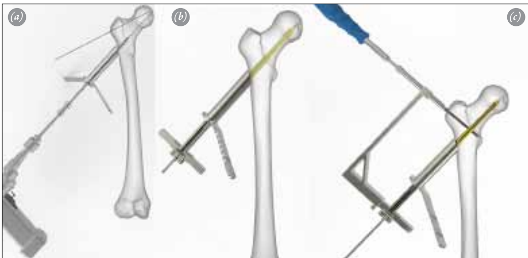
Fig. 1. The drilling and tapping of the bone (a) , the insertion of cannulated 12 mm lag screw (b) the 5 mm interlocking screw is sent to a dynamic interlocking hole which is oblong in shape with the help of an external guide. [Color figure can be viewed in the online issue, which is available at www.aott.org.tr ]

The aim of this study was to compare the biomechanical properties MIS–A–CHS, and multiple cannulated screws (CS) on a Pauwels type 3 femoral neck fracture model.