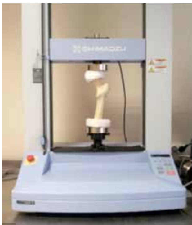
Fig. 5. The biomechanical test setting. [Color figure can be viewed in the online issue, which is available at www.aott.org.tr ]

The failure was occurred at mean 627.5 N for the group A and 912.5 N for the group B in axial loading ( p < 0.05 )