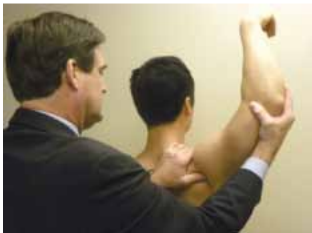
Fig. 2. The dynamic shear test is performed with the patient standing and the arm placed through an arc of 80° to 120° while the examiner places an anteriorly directed force on the shoulder. A positive test is pain in the shoulder, especially in a posterior and superior direction. [Color figure can be viewed in the online issue, which is available at www.aott.org.tr ]

Most experts agree that diagnostic arthroscopy is