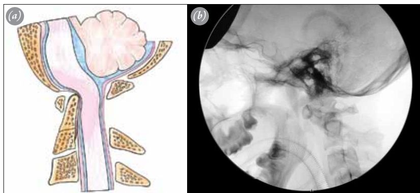
Fig. 1. (a) Compression of the spinal cord with scissoring effect at the dislocation site. (b) Radiography of AAD showing widened interspinous interval of C1-C2. [Color figure can be viewed in the online issue, which is available at www.aott.org.tr ]

Operations were performed using the dorsal approach with the patient in the military posture in a prone position. The C1-C2 complex was exposed. The head was placed into a Mayfield helmet with spinous processes positioned longitudinally on the same midline. In cases with a deeply seated C2, thoracic kyphosis was corrected and brought to the neutral position because of angulation problems in screw director and insufficient anterior tubercle fixation. A skin incision was