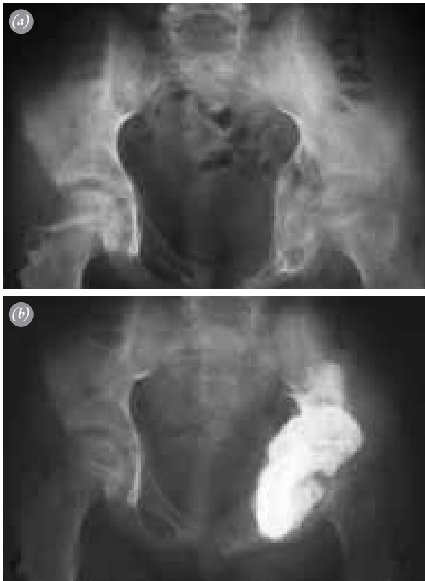
Fig. 3. (a) Preoperative anteroposterior image of the pelvis in a 9-year-old boy with ABC in the left acetabulum. (b) Image of the pelvis after curettage and bone cementing.

(mean age: 22.24; 31 females and 30 males) was 105.55 months. In the second comparison, patients younger than 20 years of age were compared to those older than 20 years of age. Mean follow-up time of the 65 patients younger than 20 years of age (mean age: 12.51; 26 females and 39 males) was 110.64 months. Mean follow-up time of 20 patients older than 20 years of age (mean age 35.5; 14 females and 6 males) was 97.35 months.