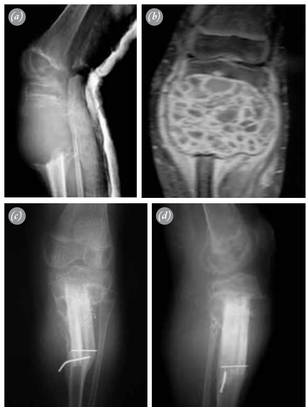
Fig. 2. (a) Lateral radiograph of a large-sized mass in the proximal left tibia in a 12-year-old boy. (b) Magnetic resonance image of the same lesion. (c) Anteroposterior radiograph taken 6 months after resection of the cyst and reconstruction with fibular autograft. (d) Lateral radiograph taken at the follow-up examination.

Patients diagnosed with ABC and treated between 1979 and 2008 in our clinic were retrospectively evaluated. Inclusion criteria were; diagnosis of ABC, treatment with