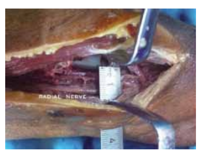
Fig. 6. Proximity of the radial nerve in the distal one third of the humerus. [Color figure can be viewed in the online issue, which is available at www.aott.org.tr]

An interobserver reliability analysis using the Kappa statistic was performed to determine consistency among raters. The interobserver reliability (kappa value) for the measurements of total humeral length (THL), the distance between lateral epicondyle and distal of anterior deltoid insertion (LE-DADI), the distance from lateral epicondyle to proximal of anterior deltoid insertion (LE-PADI), distance between lateral epicondyle and brachialis origin (proximal) LE-BO(p) and the length of anterior deltoid insertion (LADI), were found to be 0.81 (p<0.001), 0.67 (p<0.001), 0.62 (p<0.001), 0.71 (p<0.001) and 0.74 (p<0.001), respectively. These values indicate high interobserver reliability.