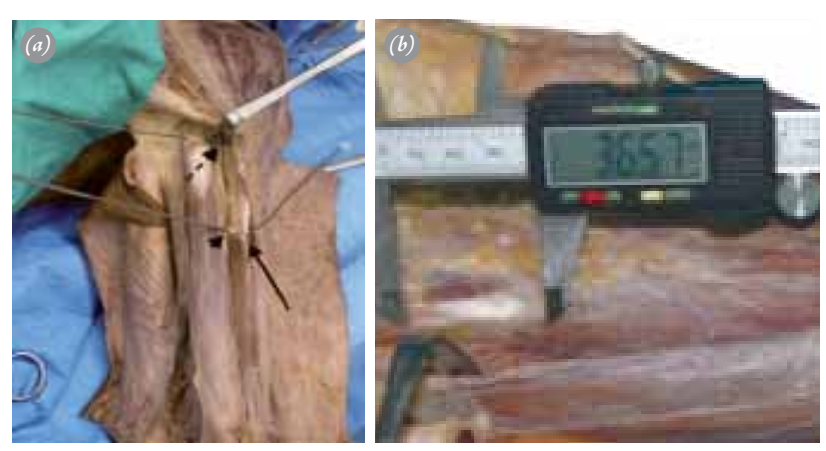
Fig. 4. (a) Proximal (broken arrow) and distal (solid arrow) points of anterior deltoid insertion, and proximal part of brachialis muscle origin (arrow head) were marked with K-wires. (b) Morphometric measurements held by digital calipers. [Color figure can be viewed in the online issue, which is available at www.aott.org.tr]

anatomy of the muscles and fascicle orientation, the skin and subcutaneous tissue were dissected from the anterior shoulder to the distal elbow. The proximal part of the greater tuberosity and the prominence of the lateral epicondyle were marked with K-wires and the distance between the wires was measured as the humeral length (Fig. 1a). To expose of the brachialis muscle and the musculocutaneous nerve, the interval between the biceps brachii and brachialis was identified, and the biceps brachii was retracted medially (Fig. 2). The deltoid and brachialis muscles were exposed from their origins to insertions with care not to disturb the integrity of the muscles. The distal part of brachialis was then divided longitudinally along its midline to reach the periosteum of the anterior cortex of the humerus. Subsequently, a submuscular extraperiosteal tunnel was prepared between the brachialis muscle and humerus with a periostal elevator. Then, we performed a retrograde advancement of a 4.5 mm narrow plate through this tunnel to identify which obstacles may interfere with the plate advancement during the MIPO procedure (Fig. 3).