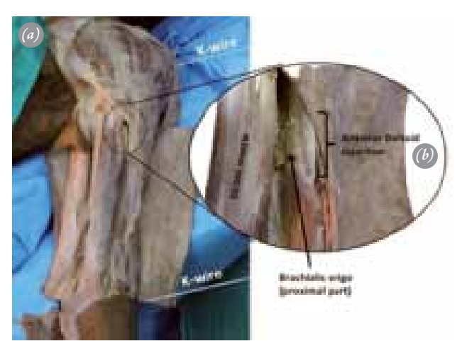
Fig. 1. Anterior aspect of the arm. (a) The proximal part of greater tubercle and the prominence of the lateral epicondyle were marked by K-wires and measured as the humeral length (b) a closer view of anatomic obstacles on anterior humeral surface; anterior part of deltoid muscle insertion and the most proximal part of brachialis muscle origin. [Color figure can be viewed in the online issue, which is available at www.aott.org.tr]

more, the faster functional recovery and return to work have also dramatically increased the popularity of the surgical treatment.<sup>[4]</sup>