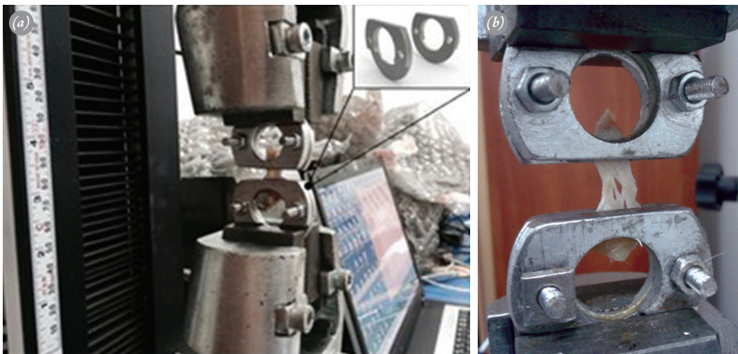
Fig. 4. (a) Mecmesin mechanical testing device and specially designed gripper jaws without nails. (b) Status of the tendon while plugged into the device during tensile test. [Color figure can be viewed in the online issue, which is available at www.aott.org.tr ]