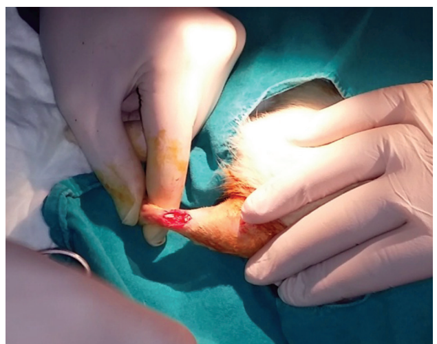
Fig. 2. Transverse cut from the 4–5 mm proximal to the sticking place of Achilles tendon. [Color figure can be viewed in the online issue, which is available at www.aott.org.tr ]

On average, 5 cc intracardiac blood was taken from the 5 rats in the donor group under high dose anesthesia, after which they were decapitated. The blood was taken by injectors with 3.8% sodium citrate, diluted by 1/10. By using Smith&Nephew Prosys PRS (PRP) bio kit (Prodizen, Inc., Seoul, South Korea) and table-type VS-5000i2 centrifuge device (Unity Medica, Sandwich,