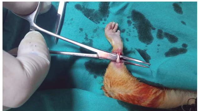
Fig. 1. Achilles tendon exploration. [Color figure can be viewed in the online issue, which is available at www.aott.org.tr ]

Consent was obtained from the local ethical board before beginning the project. The study included 25 17-month-old 25 Sprague-Dawley male rats with an average weight of 500–550 g. The rats were fed standard rodent food ad libitum in 22°C in a dark environment for 12 hours. Five rats were used as donors, while 20 rats were separated as PRP group and control group. The rats were taken into surgery under 60 mg/kg intraperitoneal ketamine-hydrochloride (HCl) and 5 mg/kg intraperitoneal xylazine anesthesia in sterile conditions. Thirty min prior to surgery, 8 mg/kg subcutaneous antibiotic prophylaxis with gentamicin was administered. Within the first 24 hours