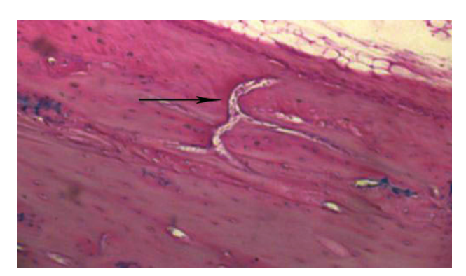
Fig. 3. Osteoblastic activity, callus formation, and vascularization in a rat in Group 2 (HE: x12.5). [Color figure can be viewed in the online issue, which is available at www.aott.org.tr]

nonunion or malunion. In some cases, the fracture site must be supported by bone graft materials. [17,20,21] In recent decades, alternative biophysical and biological treatment methods have been developed for use in the event of impaired fracture healing. Such methods include stimulation of fracture healing using mechanical, electrical, and ultrasound methods; growth promoting proteins; and osteogenic, osteoconductive, and osteoinductive methods. [22–24] In the present study, we evaluated the adjuvant effect of PTX on the healing of segmental bone defects.