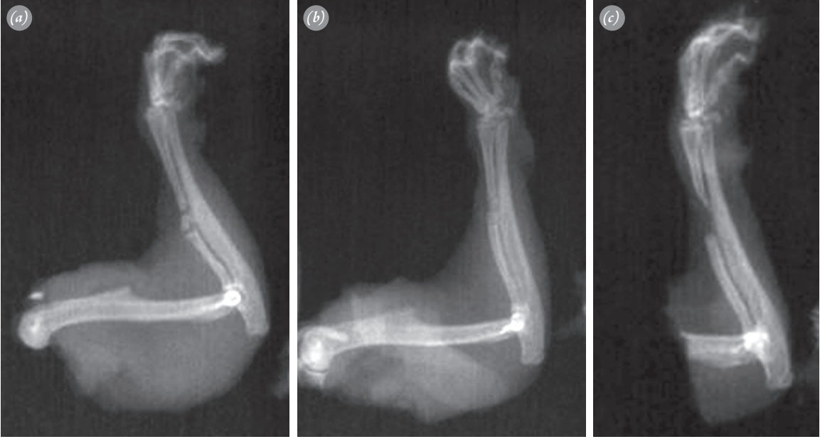
Fig. 2. (a) Radiographic image of a segmental bone defect filled with morcellized iliac crest autograft. (b) Radiographic image of a segmental bone defect filled with morcellized iliac crest autograft and receiving IP 25 mg/kg/day PTX.(c) Radiographic image of a segmental bone defect which was not filled.

Anteroposterior radiographs were taken for each specimen (Figures 2a–c). Osseous union was graded according to the radiographic evaluation scale prepared by Cook et al.<sup>[4]</sup> No device was used for radiodensity mea-