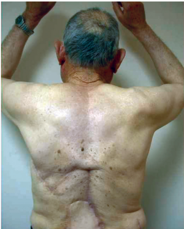
Fig. 3. 30-month follow-up. The wound healed dramatically. No donor site morbidity was observed. The patient's functional result was good. [Color figure can be viewed in the online issue, which is available at www.aott.org.tr ]

was then positioned prone for the final graft placement. After opening the back in standard fashion, the tunneled omental flap was accessed.