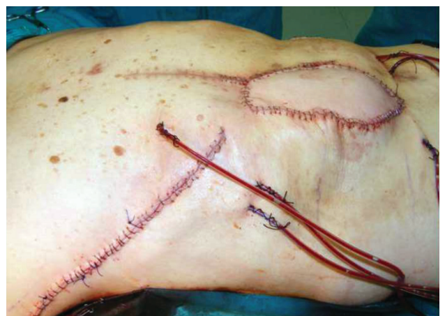
Fig. 2. A pedicular flap of the greater omentum was transported through the posterior abdominal wall to the lumbar epidural space, and reverse pedicled latissimus dorsi musculocutaneous flap was rotated to maintain healthy skin coverage on the lumbar area. [Color figure can be viewed in the online issue, which is available at www.aott.org.tr ]