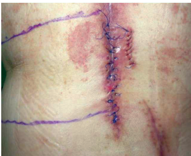
Fig. 1. Intrathecal lumbar drain was replaced with lumboperitoneal shunt, but CSF leakage from wound did not resolve. [Color figure can be viewed in the online issue, which is available at www.aott.org.tr ]

A midline laparotomy incision was made. The greater curvature of the stomach and the right and left gastroepiploic vessels were dissected. The omentum was flipped superiorly. The posterior attachments to the large colon were exposed and dissected. Small perforating branches were ligated and divided. The omentum was then isolated from stomach ligating gastric vessels. The left gastroepiploic artery was ligated and divided. The right gastroepiploic artery was ligated between the right and middle omental vessels. The distal middle omental arcade was ligated. The entire flap was isolated on the right omental artery pedicle. The flap was then passed through a tunnel created lateral to the external oblique muscle to the lumbar area and then rotated into the wound. The patient