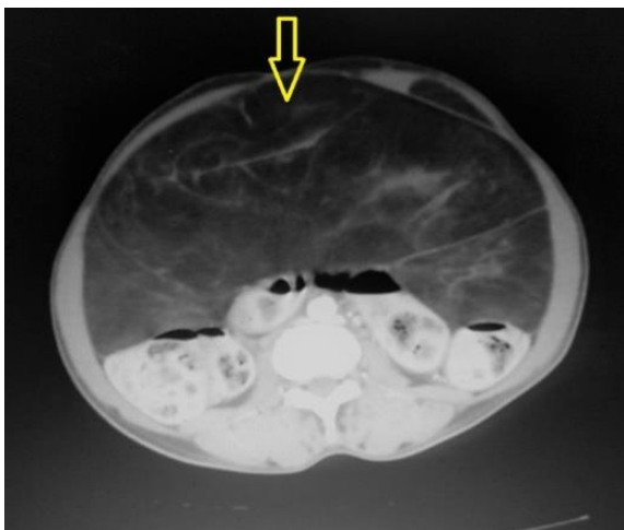
Figure 1: Computed tomography (CT) scan shows a mass of fat echogenicity measuring approximately 25 x 22cm noted within the peritoneal cavity extending from epigastrium to hypogastrum; the lesion is noted to cause indentation of the superior bladder surface and cause displacement of adjacent small and large bowel loops.

The patient underwent laparotomy. Intra-operatively, a giant lipoma measuring 40 cm vertically and 36 cm horizontally arising from the parietal peritoneum in the preperitoneal space posterior to the anterior abdominal wall was noted. Excision of the tumor was done after ligating the feeding vessels (Figure 2). The parietal peritoneum was preserved since no infiltration to the surrounding structures had occurred. The specimen weighed 3.7 kg and was sent for histopathological analysis, which showed a well-encapsulated tumor with lobules of fat separated by fibrous septa with no obvious lipoblast, suggestive of a benign lipoma (Figure 3). The post-operative period was uneventful, and the patient was discharged on the 8th post-operative day. She remained asymptomatic for 24 months post-operatively.