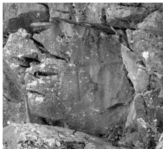
Fig. 10: The Relief of Zeus