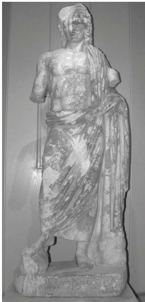
Fig. 9: Statue of Eurymedon