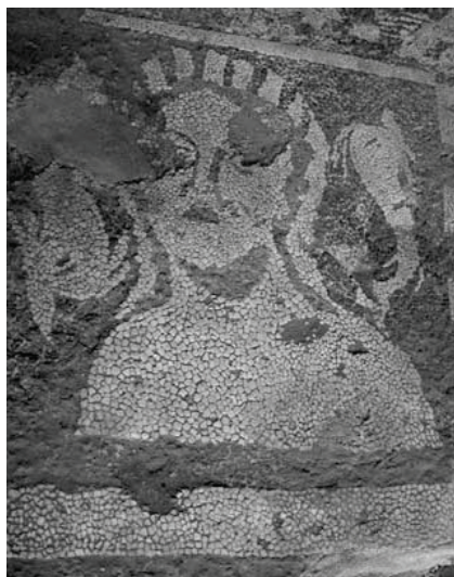
Fig. 6: River God Eurymedon