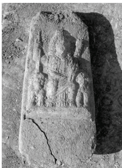
Fig. 7: Votive stele for Cybele