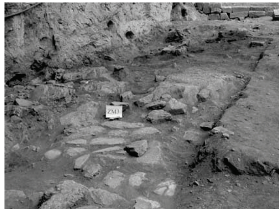
Fig. 3: The ramp paved with stones