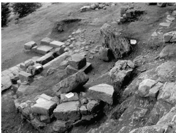
Fig. 4: The apse of the chapel