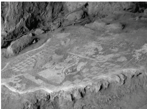
Fig. 2: The Mosaic Floor in the cave