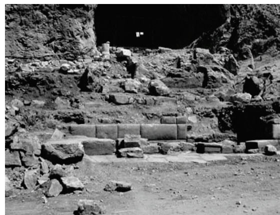
Fig. 5: Wall with pseudo-isodomic masonry