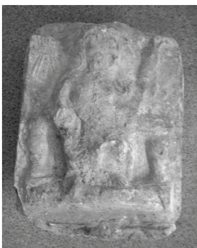
Fig. 8: The Relief of Zeus