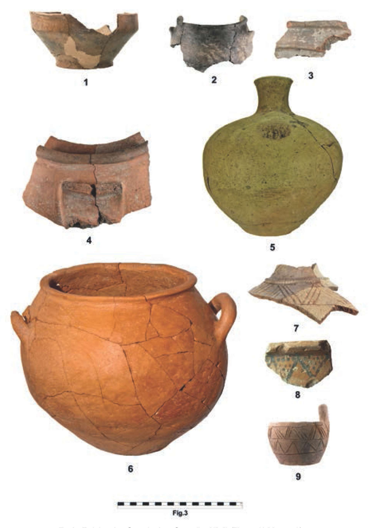
Fig. 3 - Early Iron Age Ceramics from Oymaağaç Höyük