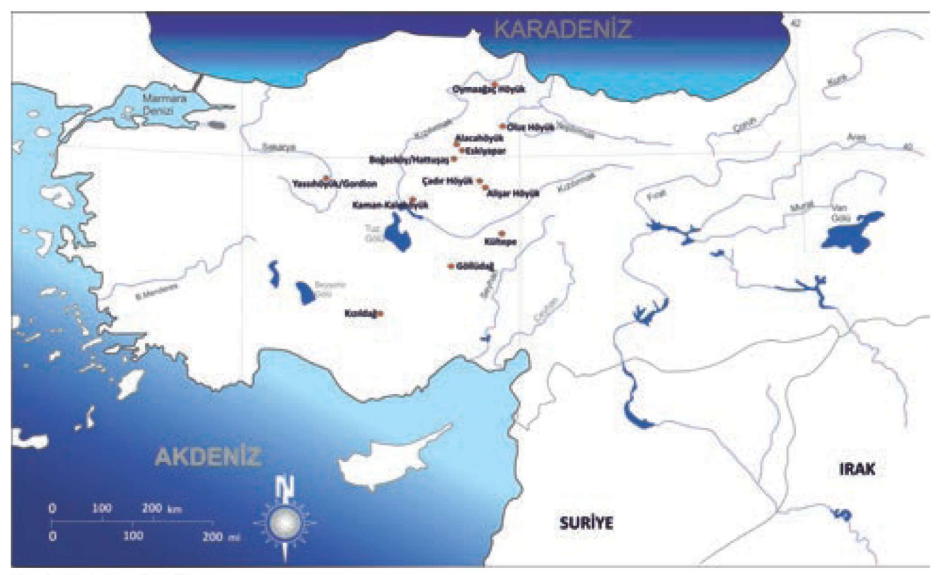
Fig. 4 - Early Iron Age Sites

discussions of the Central Anatolia EIA have continued on ceramics rather than single roomed houses in Boğaz-köy/Büyükkaya<sup>13</sup>, Çadır Höyük<sup>14</sup>, Kaman-Kalehöyük<sup>15</sup> and modest simple architecture in Gordion<sup>16</sup>.