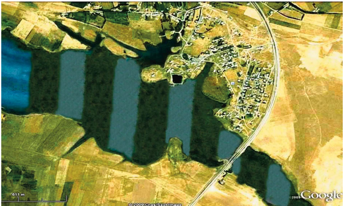
Figure 5. Suggestion model reeds cut model for the area.