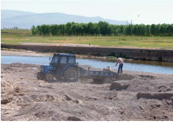
Figure 3. Taking sands from stream bed.

It has drawn attention that birds and other creatures living in the delta have concentrated in the parts where the reeds have not been damaged. It has been seen that the birds are less agitated in the areas where reeds exist but displays a panic behavior in damaged areas.