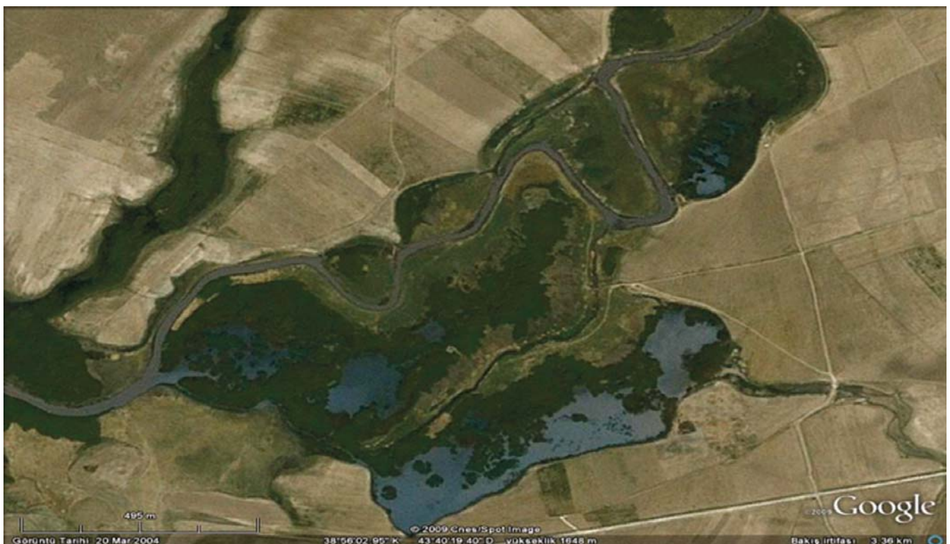
Figure 2. Situation of waters passing or bypassing through the reeds (Google earth, access date:10.01.2010).

Also, it has been observed that deformation happened in natural stream bed since building sand has been taken from river beds in some areas. It has been seen that water depth has increased in these damaged areas especially in summer time and mass fish deaths happened (Figure 3 and Figure 4).