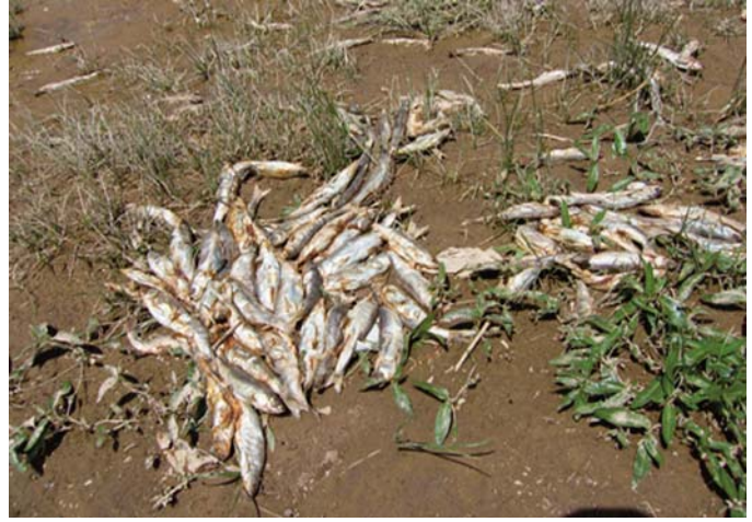
Figure 4. Mass fish deaths in the stream.

Generally taking sands from river beds and drainage activities because negative changes in water depth and flow speed.