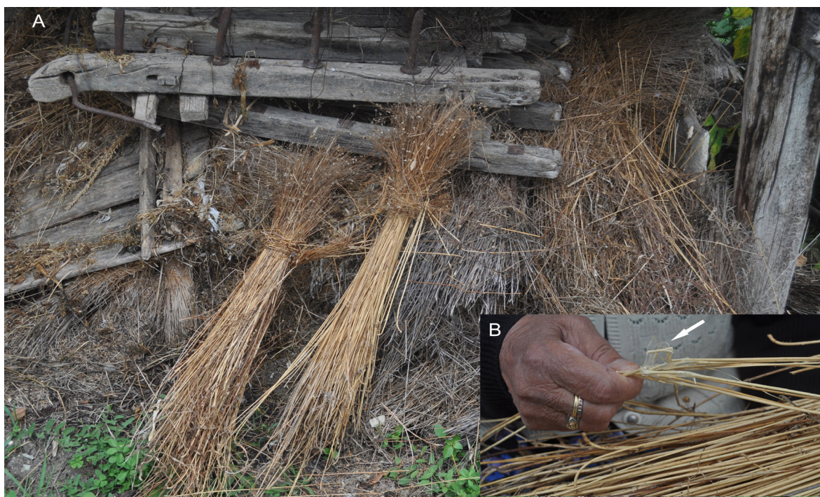
Figure 1. (a) Flax bundles harvested fragments by sickle and (b) The sclerencyma fibres extracted from crushed and wrapped stem by wrapped stem (arrow indicates the fibres).

Sowing time of the linseed is spring (summer flax) and fall (autumnal flax) per year, according to the purpose of the rancher. Early sowing (at March; summer flax) harvests in July and it prominent feature is having long fibres while late sowing flax preferable for its more linseed oil. Dry conditions support the plant for producing more linseed oil and humid conditions are favourable for tall plants giving more fibres. Density of the sowed seed per square meter affects the length of stem and villagers who are interested in fibres rather than linseed oil sow the seeds densely.