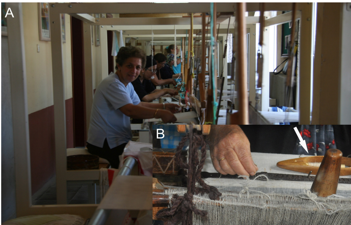
Figure 4. Voluntary students are trained for weaving, using the linen miles in the Ayancık Public Education Centre. Flax thread and mekik (the arrow indicates the mekik in the small picture).

One of the important demands to the flax rope