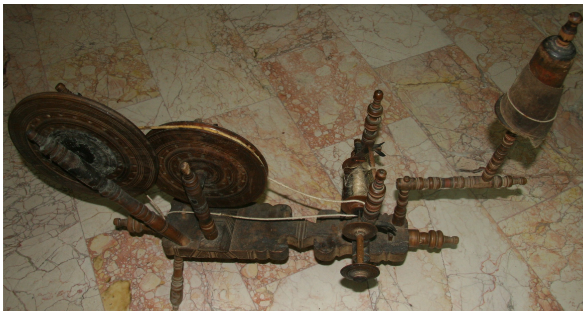
Figure 3. Çıkrık is used to make thread from the processed fibres.

In the 1950s Zhukovsky and his colleques [3] determined sixteen varieties and several subvarieties of flax in Turkey. Their names and cultivation areas are indicated on the map (Figure 2). However, Zhukovsky did not give further information about the localities or size of the cultivation areas. Variety albicans is not given in the map due to the fact that it was just mentioned in the book without collection sites and any other information. These 16 varieties have not been either cultivated by local people or represented in the gene bank of the Turkish Agriculture Ministry (TAM). Based on the study of literature and