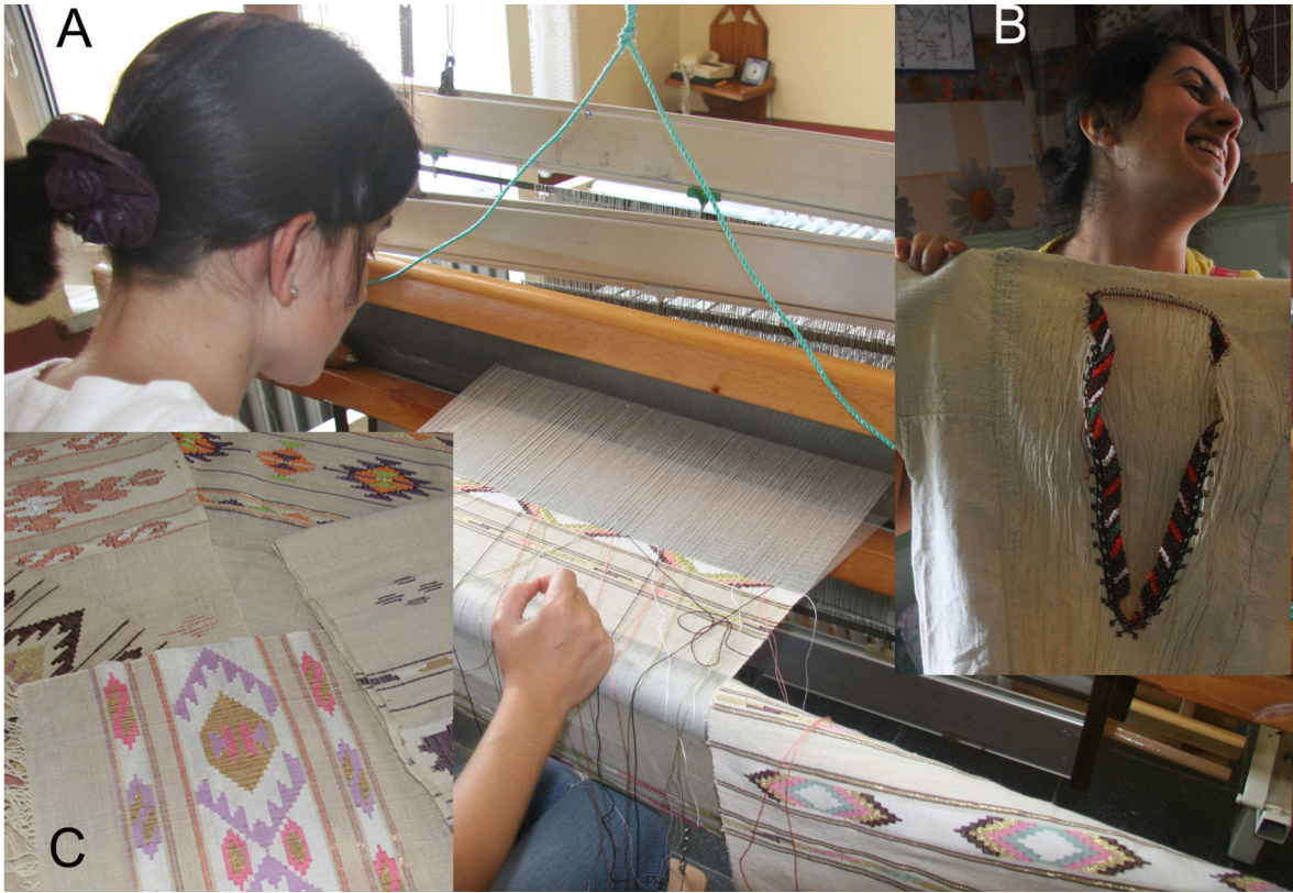
Figure 5. (a) A towel, called peşgir is being woven in the düzen (b) A cloth called "Göynek" (c) towel woven.

was shipyard of the city of Sinop which is the major area of the city. Because of the decreasing capacity of the shipyard and using the synthetic rope the demand is reduced by the time. Secondly, flax agriculture requires great effort and processing it as linen is also very difficult job.