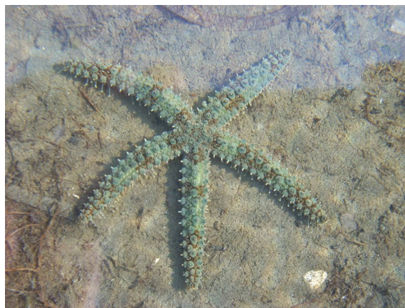
Figure 9. M. glacialis sample which was under sea tide threat.