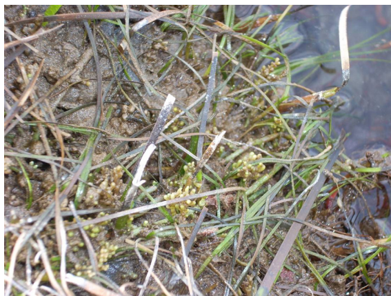
Figure 3. Invasive C. racemosa var. cylindracea within Z. noltii and C. nodosa leaves.