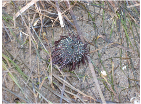
Figure 8. A decomposed sample of P. lividus .