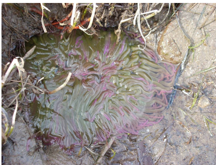
Figure 4. Anemonia sulcata var. smaragdina that was stucked into small area.