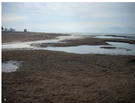
Figure 2. Low tide area with a distance of about 75 m from the coast. a) A view of tide area from the coast. b) A view of tide area from the sea. In both Figures, decomposing Z. noltii beds can be seen clearly.