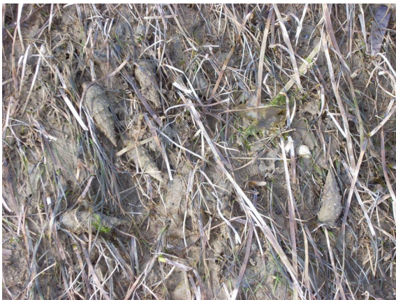
Figure 7. C. vulgatum .