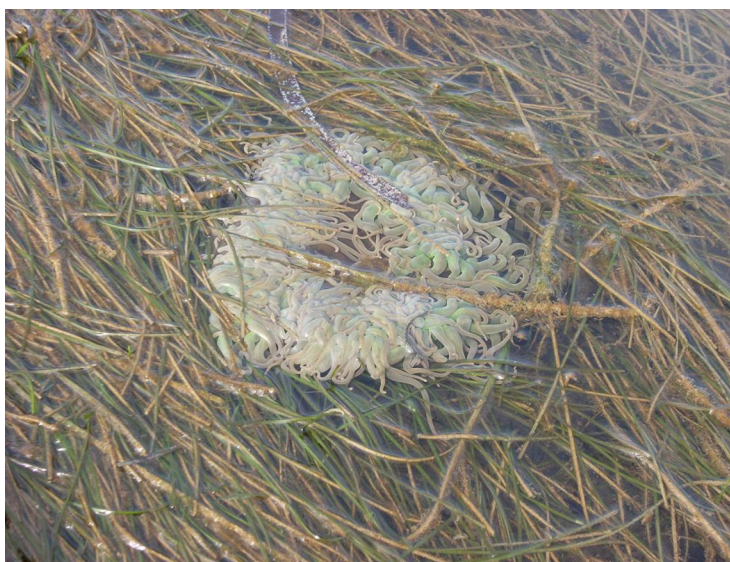
Figure 5. Anemonia sulcata var. smaragdina on Z. noltii leaves.