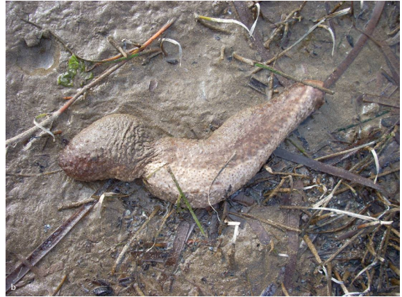
Figure 6. a) A highly decomposed sample of Holothuria sp., b) A decomposing sample of Holothuria sp.