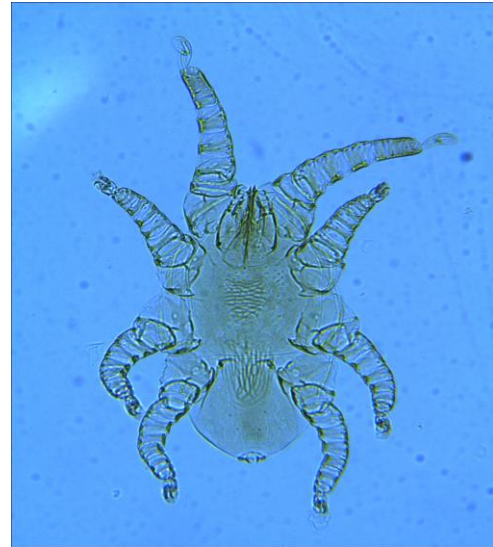
Figure 4. Sternostoma marchae , dişi ventrum.

Şekil 3. Sternostoma marchae , dişi üstten görünüm.