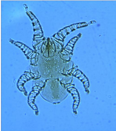
Figure 3. Sternostoma marchae , dişi dorsum.

Type material: Female holotype with two female paratypes (ZISP 4714) and 7 female paratypes (ZISP 4715, 4716) from Serinus canaria (Linnaeus, 1758) (Fringillidae), Russia, Saint Petersburg, (59° 56' N, 30° 18' W), 02 July 2010; coll. I. Dimov.