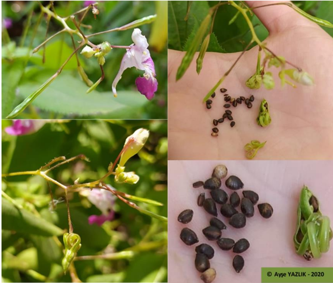
Figure 3. Fruit capsule, popped fruit capsule and seeds of Impatiens balfourii .