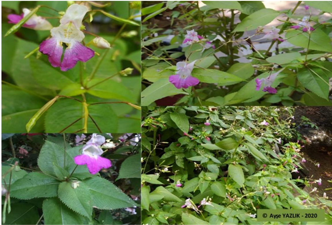
Figure 2. Habitats, flowers, fruits and leaves of Impatiens balfourii .

Considering the general detections in Düzce and the EUNIS habitat classification system (EUNIS, 2020), I confirm that I. balfourii is located the forest edge habitats, grasslands (not arable fields), inland surface water and artificial habitats (roadsides, parks, gardens) in Turkey.