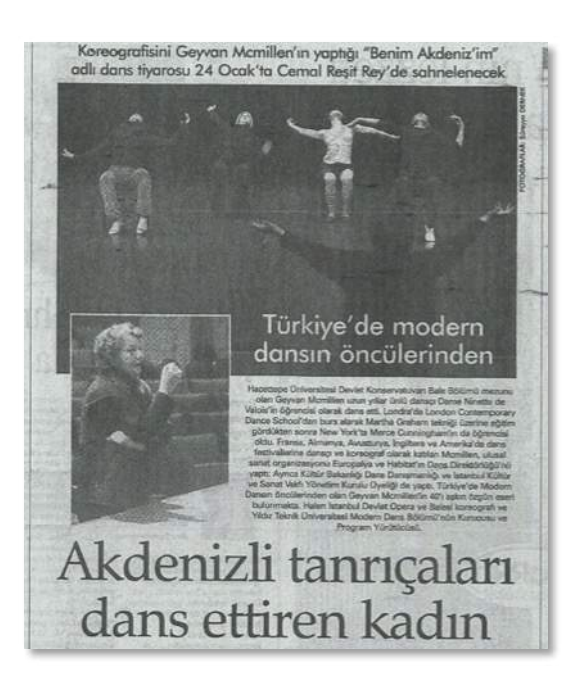
Vatan Newspaper, January 10th 2004

In the early 2000s, CRR Dance Theater Company brought great dynamism to the Istanbul art scene. It can easily be said that between 2003 and 2005, i.e. during the staging period of its productions, the company was a pioneering culture and art project that was implemented with an art vision and contemporary approach that had the ability to sustain its effect for longer periods. It is obvious that the CRR Dance Theater Company acted as an institution capable of meeting the needs of young generation dancers under dance education in the field of performing arts as well as the Istanbul audience. In this respect, it definitely deserves a major position in the Turkish Modern Dance History literature. This period also played a big role in the formation of substantial behind-the-scenes teams, working and gaining experience in the field of performing arts. It is an undeniable fact that the decision to shut down a dance company, which has succeeded in presenting its productions to larger audiences and in a respectively short time period has attracted the attention of international art platforms, resulted with a serious gap in Turkish Modern Dance studies and practices.