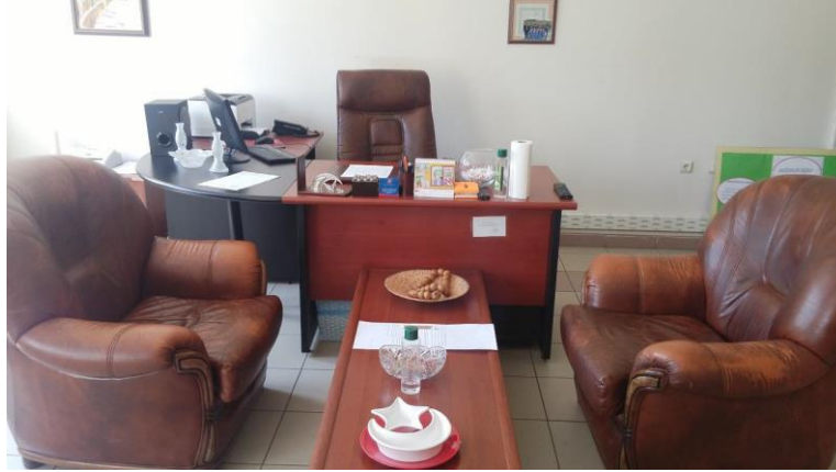
Figure 1. A visual of a setting where an interview was held with a parent of a student who was not diagnosed with giftedness