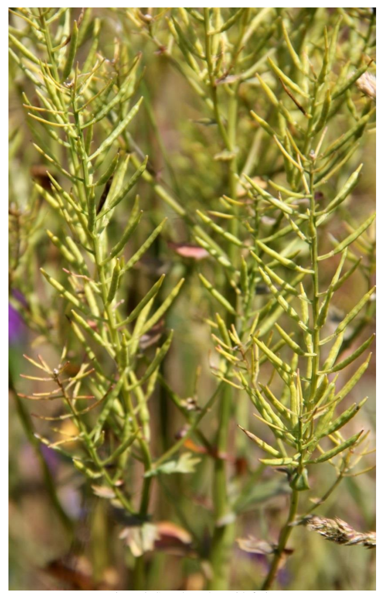
Figure 3. Stem branches with fruits Şekil 3. Meyveli gövdeler

Biannual or perennial, up to 50 (65) cm, glabrous. Lover leaves with 2-4 pairs of lateral lobes; upper leaves pinnatifid. Inflorescence is a bracteate raceme or at least in the lower half; petals 55 mm; pedicels are 2-4 (-6) mm in fruit. Siliquae 15-30 x 1-2 mm; valves with distinct median vein; style 1-2 mm. Flowering time is April to May in İstanbul (Figure / Şekil 2-3).