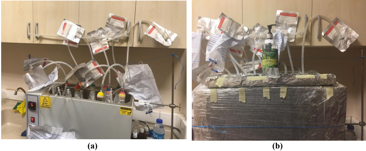
Figure 1. Anaerobic digestion test setup (a) before start, (b) during AD process

1877 mg O 2 /L, respectively. The inoculum/substrate ratio of all reactors was set at 1.0 on a TS basis. Additionally, to determine soluble chemical oxygen demand (SCOD) removal, the sample was taken from each reactor every 5 days. AD process was concluded about 40 days.