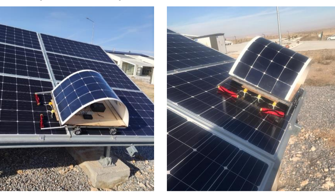
Fig. 3. Photo of the developed robot

opportunity to use a panel with greater power than we would normally use. The robot, which receives its energy from the panel, transmits the energy to the motors and moves in line with its software. In autonomous mode, robot does not clean the same place twice.