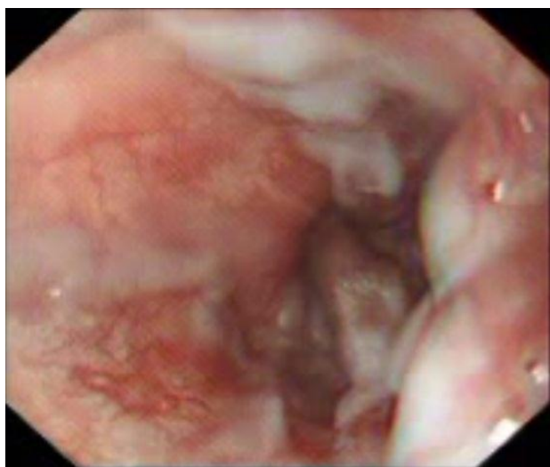
Figure 1. Esophageal varices of a 2 year-old child with biliary atresia

the child is hemodynamically stable, further evaluation can proceed. A detailed history including the duration, chronicity and recurrence of bleeding along with accompanying gastrointestinal symptoms, such as nausea, vomiting, abdominal pain and characteristic of defecation should be obtained. Use of medications such as nonsteroidal anti-inflammatory drugs that may cause mucosal injury should be questioned. The presence of an infection that causes vomiting and Mallory-Weiss tear should be investigated. The medical history of a patient with chronic disease, such as chronic liver disease with esophageal varices, is also important to determine the etiology of UGI bleeding.