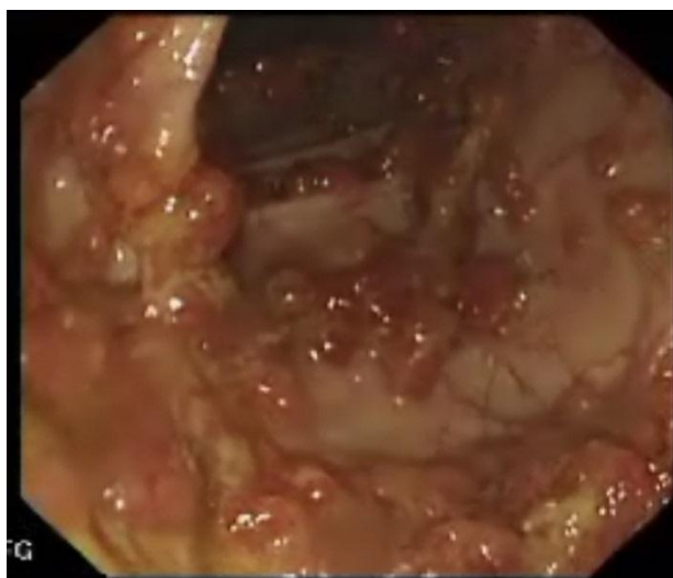
Figure 3. Multiple adenomatous polyps throughout the colon of a 10 year-old child with familial adenomatous polyposis syndrome. The patient underwent colectomy.

passage of mucus and straining on defecation, tenesmus, perineal and abdominal pain, sensation of incomplete defecation and rectal prolapse [40].