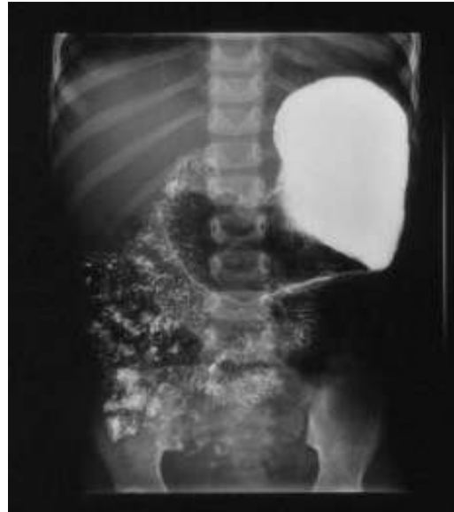
FIGURE – 2: Upper GI barium study showing dilated stomach with retained dye after 2 hours of study.

Body asymmetry and café-au-lait macules were not found. Abdomen was soft, non-tender but upper abdomen was full with visible bowel loop. Rest examinations were normal. Ultrasound and Barium study were suggestive of malrotation. Stomach and duodenum (D1) were dilated and had retained dye after 2 hour of dye ingestion [Figure 2]. Bone age was delayed (X-ray wrist showing only 2 carpals) [Figure 3].