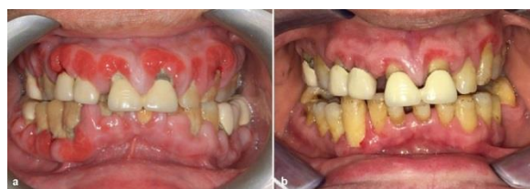
Figure 2. Initial intraoral view of Case 2 showing generalized gingival overgrowth (a). One-month follow-up view showing the regression in gingival overgrowth following the substitution of the drug and non-surgical periodontal treatment (b).

By consultation with the patient's physician, the suspected drug was substituted with another antihypertensive agent containing a combination of angiotensin converting enzyme inhibitor and thiazide derivative, ramipril and hydrochlorothiazide (5 mg/25 mg). Non-surgical periodontal treatment including scaling and root planning was performed. Regression in generalized gingival overgrowth was noticed after a month of drug substitution and proper plaque control. The red band appearance on labial gingival margin began to disappear but was not completely eliminated (Figure 2b).