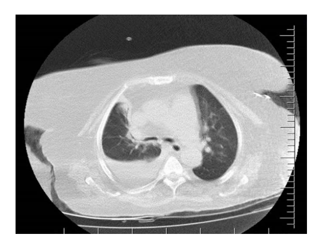
Figure 1. Thoracic CT of the patient shows right pleural effusion (empyema?).

The patient was reintroduced. In the thoracic CT of the patient, right pleural effusion (empyema?) and fluid collection in the major fissure and cardiothoracic ratio was greater than 50%. Parenchymal infiltration was not detected (Figure 1). In laboratory examinations; White blood cell count was 4700 / mm³, hemoglobin level was 11 g / dL, and thrombocyte count was 187000 / mm<sup>3</sup>. In biochemical examination; albumin level was 3.3 g / dL, aspartate aminotransferase (AST) level was 45 U / L, alanine aminotransferase (ALT) level was 41 U / L. Among the acute phase reactants, the erythrocyte sedimentation rate (ESR) was 82 mm / hour and the C reactive protein (CRP) level was 13.6 mg / dL. At the second day of the patient's hospitalization, she had a fever, reaching 38.2 °C especially at night. Cough and sputum symptoms are also added to his symptoms. COVID-19 PCR test was taken again. It was negative. There was no growth in sputum, blood and urine cultures. Ehrlich-Ziehl-Neelsen (EZN) staining sent from sputum three times resulted in negative. Brucella (Rose Bengal), anti HIV, anti HCV, VDRL, HbsAg test results were negative for differential diagnosis. Abdominal ultrasonography (USG) was requested, no abnormality was dedected.