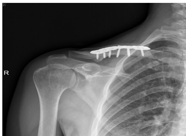
Fig. 3. 42 year's woman's follow-up shoulder AP x-ray image showing that achieved union clavicle comminuted fracture