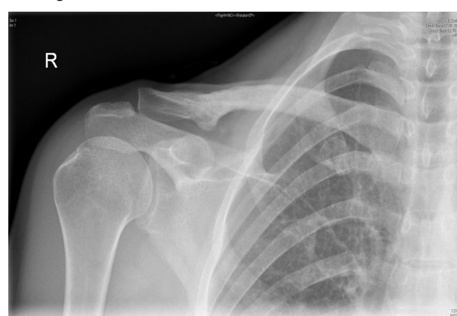
Fig. 4. 42 year's woman's follow-up shoulder AP x-ray image showing that achieved union clavicle comminuted fracture after the implant is removed