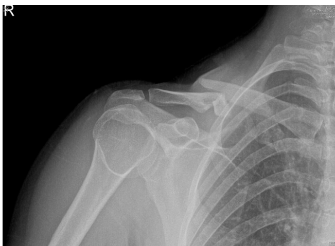
Fig. 1. 42 years woman's shoulder AP x-ray image showing that clavicle comminuted fracture