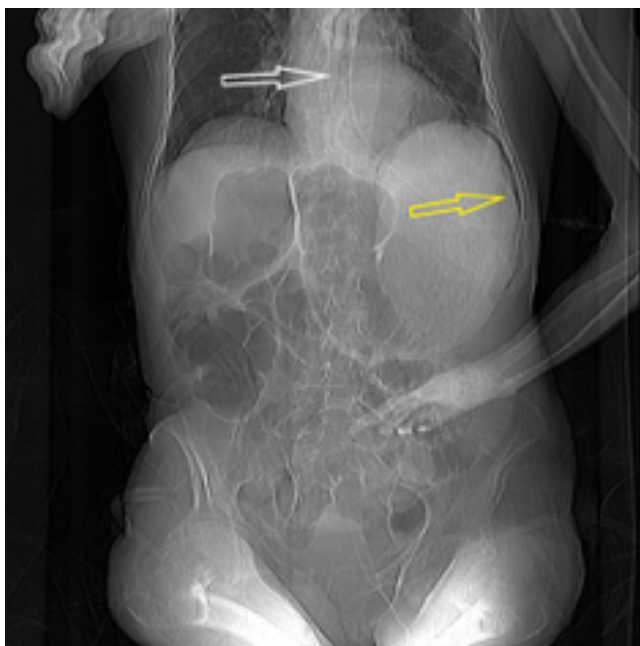
Figure 1: Plain abdominal X-ray finding - gas in the gastric (yellow arrow) and esophageal wall (white arrow)