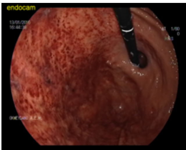
Figure 3: Gastroscopy finding with mucosal ischemia

The initial treatment of EG (if perforation is excluded) is advised to be medical 9 . However, the treatment should be individualized due to the patient's condition. Surgery is recommended in cases of clinical deterioration, positive peritoneal signs, suspicion for necrosis or failure of the medical treatment 8 .