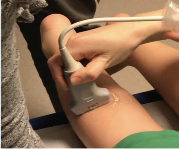
Figure 2: Ultrasonographic measurement of the gastrocnemius muscle.

It is critical to adopt physiotherapy approaches that optimize the child's potential by focusing on function and movement in CP rehabilitation. The importance of 2-8 weeks of strengthening exercises in healthy children to increase EMG activation by training nervous mechanisms and motor unit firings is emphasized (5, 7). Vercuren et al. emphasized that exercise training should be continued for at least 12 weeks to be effective in children with CP (17). A 12-week neurodevelopmental treatment program for children with hemiparetic CP was applied in this study.