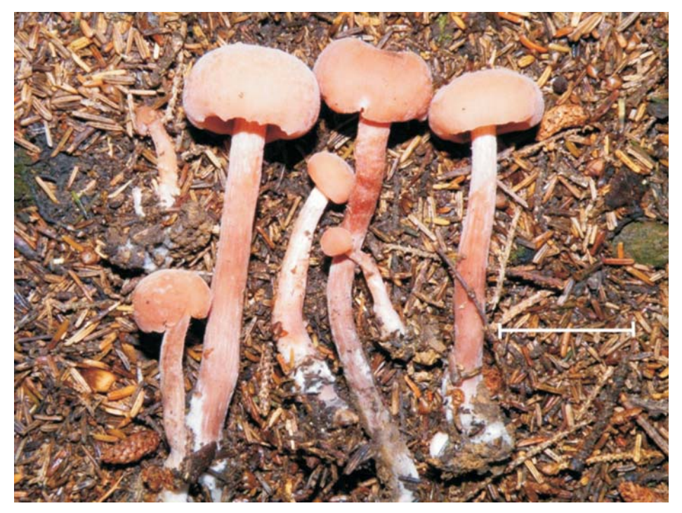
Figure 1. Laccaria macrocystidiata - basidiomata (bar = 2.5 cm)

in a plastic bag to obtain spore prints and the rest of them were dried for future studies. Some microscopic studies were performed at the Royal Botanic Garden Edinburgh according to Clémençon (2009). Identification of the collection and descriptions were made following Contu (2003) and Roux (2009).