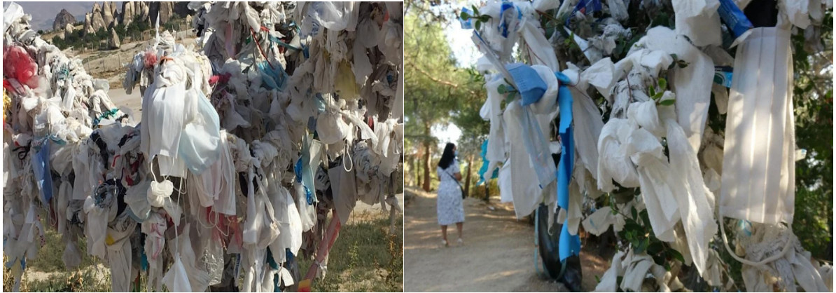
Figure 5. They hung a mask on the 'wish tree' in Cappadocia and 'Wish trees' filled with fun masks at Zeus Altar

With COVID-19, sustainable healthcare medical waste management is more important than ever to protect communities, healthcare workers and the planet and prevent pollution. Of the 127.4 million tons of waste processed in waste disposal and recycling facilities in Turkey, 78.3 million tons are disposed of and 49.1 million tons are recovered solid wastes. The number of total wastes were processed increased by about 22% during the pandemic period compared to 2018. While protection materials should be disposed of, unfortunately, it is even seen that personal protection masks are hung in some historical areas for superstitions in a way that can be said ridiculous in Turkey (Figure 5).