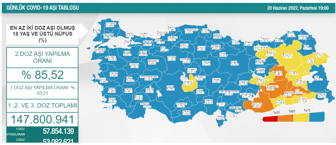
Figure 1. Vaccination numbers and risk map by provinces in Turkey (URL-02)

It is not possible to say that the covid-19 pandemic has completely ended worldwide. It continues with new mutations (Figure 2). Although, depending on the immune mechanism in humans, the depth disappears as much as in previous periods, but it is not exactly known what new mutations may cause.