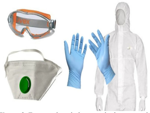
Figure 3. Face mask and gloves and other protection materials.