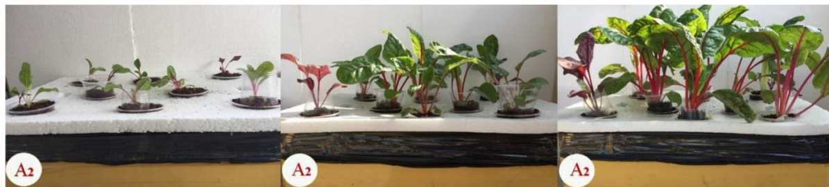
Figure 1. Effect of Hoagland hydroponic nutrition on the growth and development of Rainbow mustard ( Beta vulgaris subsp. Vulgaris ) after 10; 20; 30 days (left to right respectively).

Effect of media on the growth and development of Rainbow mustard ( Beta vulgaris subsp. Vulgaris ) after 30 days