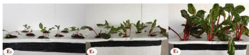
Figure 4. Effect of concentration of 0.6 g / l thiamine HCl (vitamin B1) on the growth and development of Rainbow mustard ( Beta vulgaris subsp. Vulgaris ) after 10; 20; 30 days (from left to right respectively)

The analytical results in Table 4 and Figure 3 show that the concentrations of thiamine HCl (vitamin B1) have different effects on the growth of Rainbow Chard.