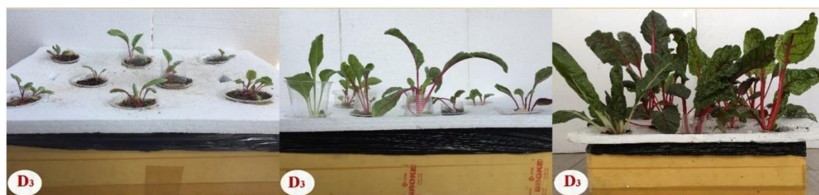
Figure 3. The effect of the 30:70 media mix ratio on coir and sand on the growth and development of the Rainbow mustard ( Beta vulgaris subsp. Vulgaris ) after 10; 20; 30 days (from left to right respectively).

This experiment added thiamine HCl (vitamin B1) at a concentration of 0.6 g / l to the Hoagland nutrient medium, the Rainbow mustard ( Beta vulgaris subsp. Vulgaris ) in the soaked hydroponic system. Roots will grow and develop better than without thiamine HCl (vitamin B1).