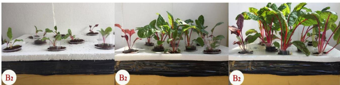
Figure 2. Effect of coconut fiber media on the growth and development of Rainbow mustard ( Beta vulgaris subsp. Vulgaris ) after 10; 20; 30 days (from left to right respectively).

Note: In the same column, the average values with the characters (a, b, c, d) followed the same with no statistical difference ( P < 0.05 ) (-): No figures available.