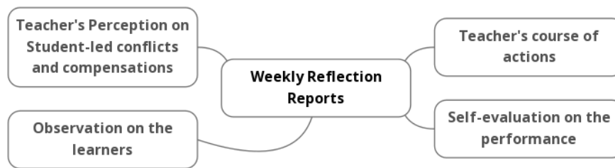
Fig. 2. Weekly reflection reports- emerging themes

As for the System-related network, there have been two main features observed to be interfering with CM: Internet Connection , and Computer-related as seen in Table 5 . Internet connection issues were typically unforeseen, but they were attempted to be tolerated quickly by the teacher. For instance, when the internet connection got unstable and the voice of the student was lagging, another student was given permission to speak rather than waiting for the same student to resolve the connection problem and reply. However, there were a few times when the teacher's internet connection was unstable, thus she was dropped out of the session. This was potentially distracting since the host became another student and the students would go haywire over the screensharing of that host student. As expected, it took quite a time to calm the students down and get the learning atmosphere back when the teacher came back as a host. On the other hand, Computer-related challenges such as running slow, and lagging were often resolved with the help of Soother role of the teacher.