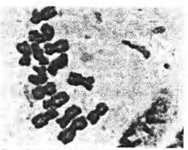
Fig. 1. Chromosomes of root tip cells of Pisum arvense L. (X 2448).