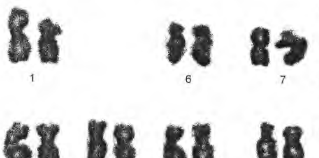
Fig. 2. Karyotype of Pisum arvense L. (X 2448).

Fig. 1. Chromosomes of root tip cells of Pisum arvense L. (X 2448).