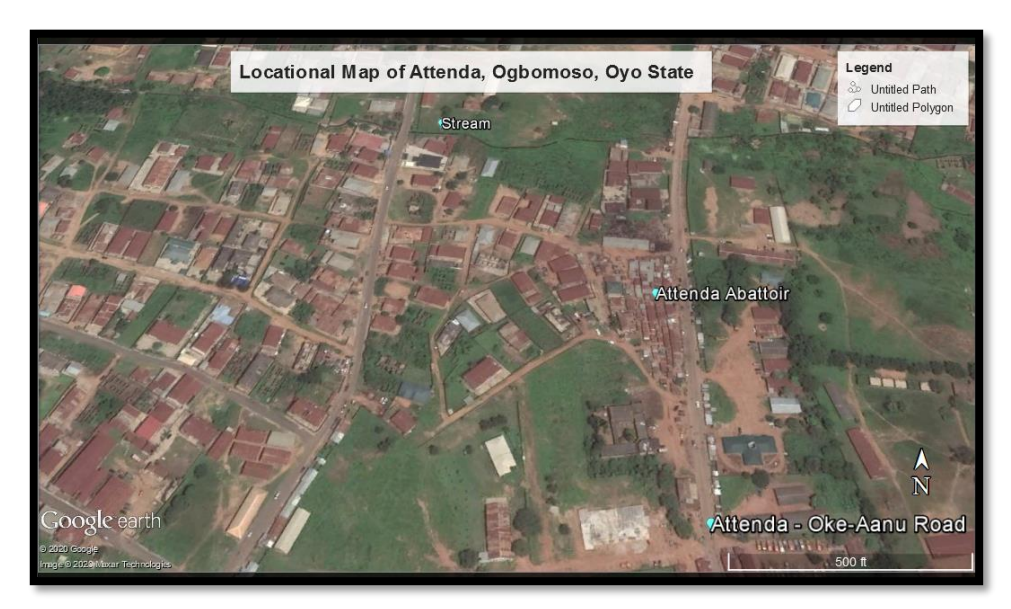
Figure 1. Locational Map of Attenda Abattoir, Ogbomoso, Oyo State

To assess the characteristics of the waste, 5kg of daily disposed semisolid waste in the abattoir were collected, sorted and each constituent was weighed. To assess the impact of the abattoir, water samples were obtained from Point of Discharge (POD) of wastewater to the stream, 30 meters, 60 meters and 90 meters on the course of the stream. Also, samples were obtained from each well found within 30 meters, 60 meters, and 90 meters from the abattoir. Collection of samples at intervals to determine the distance decay, if any, of the abattoir. The obtained water samples were tested for pH, Conductivity, Lead, Dissolved Oxygen, Cadmium, and bacterial content - Salmonella sp. and E. coli, using the procedure of [7]. Obtained data were subjected to descriptive statistics such as frequency count and percentage. Tables were also used to summarise data.