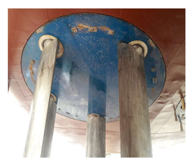
Fig. 3. VSP systems with 6 six blade in 80 BP escort tugs in Kurtarma 10 vessel.

On the other hand, the cycloidal propulsion, also called the Voith-Schneider propulsion (VSP or Voith), is installed mostly at the bow. In VSP systems the propellers are protected by a guard. General propeller efficiency ( \eta d) is low and mechanical losses are high in vertical axis propellers. However, their maneuverability is quite high. For this reason, such propulsion systems are preferred in operations requiring acceleration and rotation.