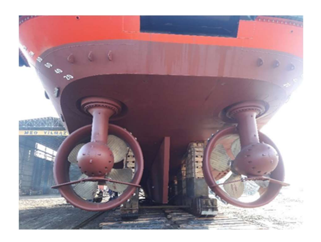
Fig. 2. Wartsila WST-24 model ASD in 70 BP harbour tugs owned by Coastal Safety.

On the other hand, the cycloidal propulsion, also called the Voith-Schneider propulsion (VSP or Voith), is installed mostly at the bow. In VSP systems the propellers are protected by a guard. General propeller efficiency ( \eta d) is low and mechanical losses are high in vertical axis propellers. However, their maneuverability is quite high. For this reason, such propulsion systems are preferred in operations requiring acceleration and rotation.