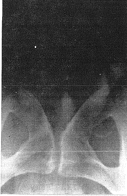
Figure :1. Appearance of the calculus on plain film.

organic pathology at first, then to investigate the erectile disorder. However, the rapid improvement in erectile function lead us to think whether such a calculus can cause erectile dysfunction or not.