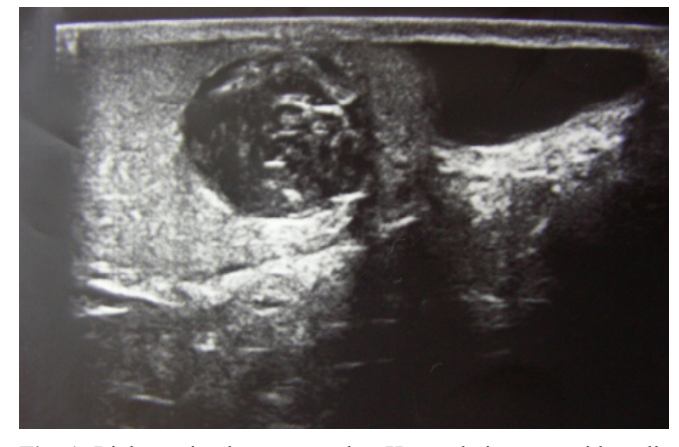
Fig. 1. Right testis ultrasonography: Hypoechoic mass with welldefined margin

Macroscopically, a 1.5 cm-wide encapsulated cystic mass filled with yellow, paste-like material was identified in the section of 4.5x3.5x2.5 cm left orchiectomy material removed together with 9-cm long spermatic cord. There was no pathological features in adjacent testicular parenchyma. Microscopic study identified a cystic lesion which was sharply delineated from the surrounding testis parenchyma. It was partially compressed, lined by stratified squamous epithelium with granular layer and filled with lamellar keratin material (Fig. 2).