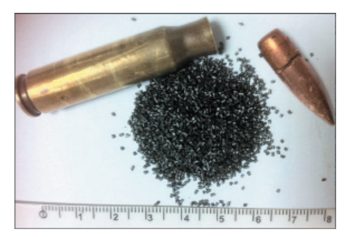
Fig. 1. Heavy machine gun bullet with big calibre (7.62 mm) and gunpowder particles.

A 30-year-old noncommicent officer injured by the explosion of a heavy machine gun loaded with a big caliber (7.62 mm) bullet during the battle training (Fig. 1).