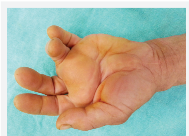
Fig. 2. Giant lipoma of hand.