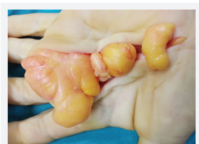
Fig. 3. Intraoperative image of tumour.