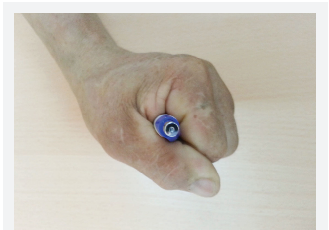
Fig. 5. Patient's grip strength fully recovered after two months.

and Tachibana, 1993). Lipomas are delicately encapsulated benign lesions, and MRI is the most reliable tool for their diagnosis, as well as reckoning their size and projections (Horch et al., 1997). The treatment is simply surgical removal (Inaparthi and Southgate, 2006). Lipomas are unlikely to recur after excision. Then again, the surgeon needs to be vary for prevention of recurrence and treatment of complications such as infection, nerve injury and soft tissue problems.