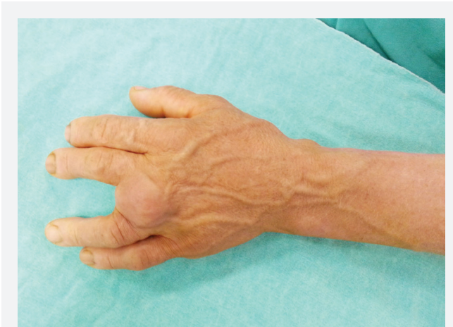
Fig. 1. Giant lipoma of hand.