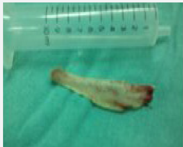
Fig. 3. Foreign body—chicken bone

In esophageal foreign bodies, the major symptoms caused by irritation are dysphagia, hypersalivation and odynophagia. Although the 80-90% of the foreign bodies which lodged in the esophagus passes spontaneously, 10-20% requires endoscopy and 1% requires surgical intervention (Pinto et al., 2012). The foreign body which has penetrated into the esophageal wall can weaken the wall by local inflammation and causes a perforation, and this perforation may cause life-threatening conditions such as mediastinitis, aorto-esophageal-esophagotracheal fistulas, retropharyngeal or epidural abscesses (İnci et al., 1999).