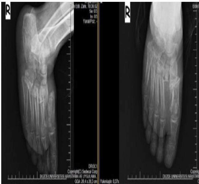
Fig. 2. X-ray images of Charcot's joint

Neuroarthropathic fracture and dislocations may result from minor injuries for example sprains as well as repeating little traumas. They may also rarely develop secondary to major traumas such as falls and traffic accidents (Öznur et