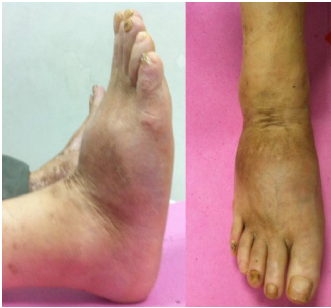
Fig. 1. Photographic images of the patient with Charcot's joint

C-reactive protein levels were normal. Patient was referred to orthopedic outpatient clinic and magnetic resonance imaging was performed but it could not give enough information for discrimination between neuroarthropathy and osteomyelitis. Hence three-phase Tc-99m bone scintigraphy was performed and findings were interpreted as supporting the diagnosis of Charcot's neuroarthropathy (Fig. 3). Patient was taken to outpatient follow-up by orthopedic clinic and his current osteoporosis treatment with alendronate monosodium trihydrate plus vitamin D 3 was continued. Insulin doses of patient who had poorly controlled diabetes were re-regulated by Diabetes outpatient clinic, and he was advised to use proper shoes.