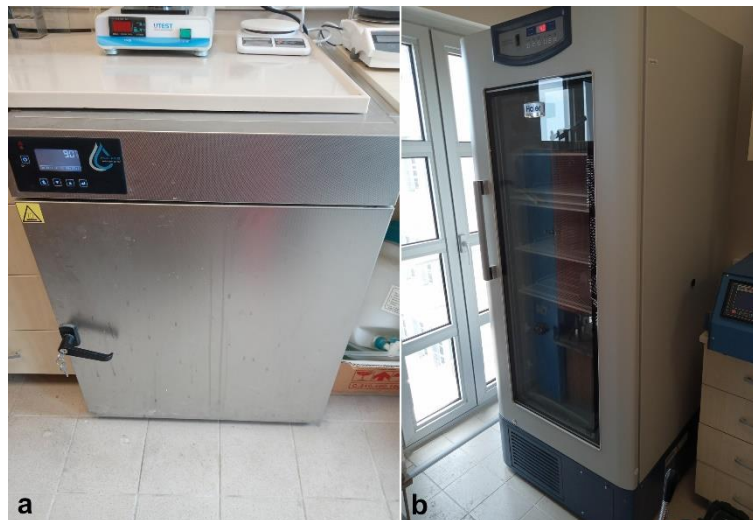
Figure 3. Stove (a) and refrigerator (b) used in the thermal cycles

To investigate thermal changes effect on the energy absorption capacity values of the cement paste specimens, a refrigerator at 3 °C and a stove at 90 °C were respectively used for 16 cycles (Figure 3). There were two water tanks in the refrigerator and the stove. Specimens with and without the polymer additive were immersed in the water tanks together and had totally same thermal change procedure in water. After a 5 days curing time, thermal cycles were started. In the thermal change procedure, heating at 90 °C (120 minutes) and cooling at 3 °C (120 minutes) were carried out twice a day for eight days. Specimens were kept out of water at the end of the daily thermal cycles. To speed up the effect of the thermal cycles, temperature changes were applied immediately making a thermal shock in water. At the end of the cycles, specimens were kept out of the water for a day. Specimens which were not exposed to the thermal cycles were cured in the room temperature and not kept in water. Totally, 18 specimens were used in the Charpy test and 9 of them (3 for each MSP amount) were exposed to thermal cycles.