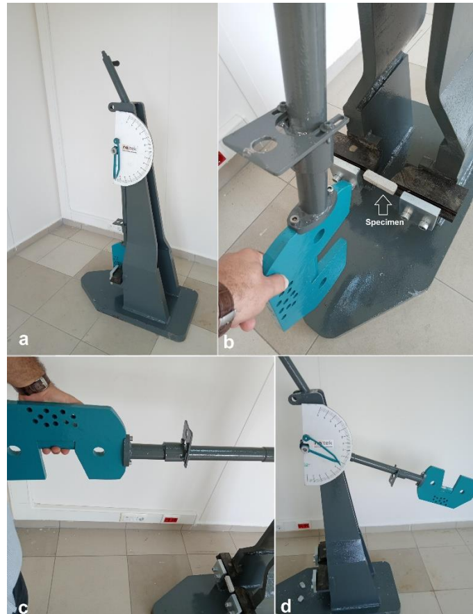
Figure 2. a) The Charpy impact test equipment, b and c) raising the hammer, d) hammer after fall