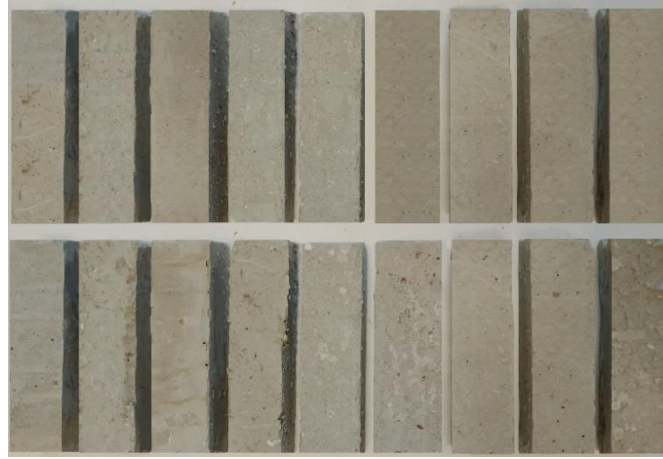
Figure 1. Specimens used in this study

that the percentages are the ratio of polymer additives to total mix (cement + water + polymer) weights. The paste mixes were homogenized in a concrete mixer for 8 minutes. The Charpy impact test specimens were casted into moulds with the the sizes of 22 mm x 22 mm x 80 mm, compacted using thin tamping rods, and put on the vibration table to remove air in fresh mix. The Charpy impact test equipment which is convenient for the cementitious specimens were used in the experimental studies. As the hammer of the Charpy test is dropped, the impact energy was applied on the specimens. The three point bending effect was induced under the immediate load condition as the falling hammer applies load to the specimens. Specimens used in this study is seen in Figure 1. In the Charpy impact test, specimens with the curing time of 14 days were used (Figure 2).