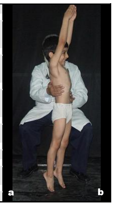
Figure 2: (a) Typical routine of a day at gymnastic school; (b) a 5-year old boy, dressed in briefs, barefoot, stripped-to-waist, being helped to grab the bar

Pre-departure inspection and handing over students to their parents.