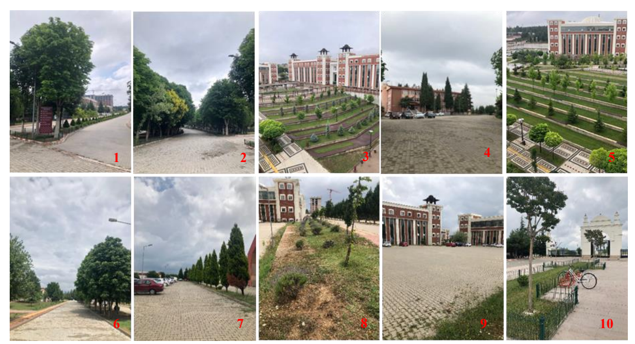
Figure 4. Images from the BSEU campus area (1-2-4-6: Main circulation, 3-5: Campus square (public areas; 7-9: Car park; 8: Green area separating car park and main road; 10; bike parking are)