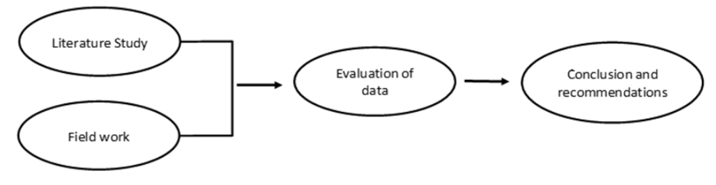
Figure 3. Study diagram