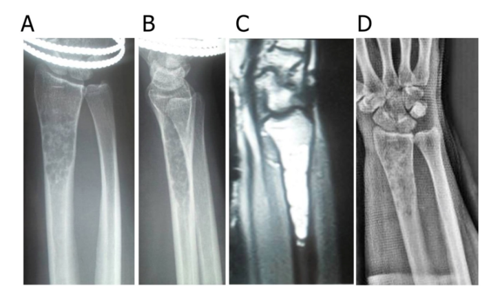
Figure 1: A 24-year-old female with distal radius enchondroma: a,b) preoperative plain radiograph, c) preoperative magnetic resonance image, d) the patient underwent curettage followed by graft packing.

Abbreviation: PMMA, polymethylmethacrylate