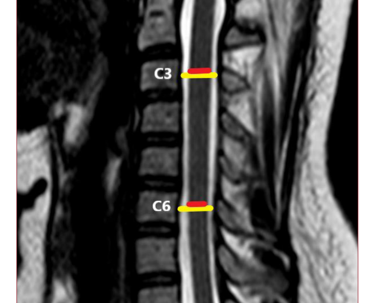
Figure 1. Antherio-posterior (AP) spinal canal (red line) and spinal cord (yellow line) diameter at the mid-vertebral level C3 and C6 in the sagittal plane.

All examinations were performed with a 1.5 Tesla MR system (Sonata; Siemens Medical Solutions, Erlangen, Germany). Imaging was obtained with patients in a neutral supine position. T2-weighted sagittal turbo spin echo sequence (time-to-echo 108 ms; time-to-repetition 3000 ms; slice thickness:3.4 mm; field of view 568x640) and T2-weighted axial (time-to-echo 105 ms; time-to-repetition 4280 ms; slice thickness:3.0 mm; field of view 608x608) images were used for measurements. Anterior-posterior (AP) spinal canal and spinal cord diameter were measured at the mid-vertebral level C3 and C6 in the sagittal plane ( Figure 1 ). Spinal cord area was measured at the disc levels in the axial plane using a manual measurement ( Figure 2 ). All measurements were made by the same radiologist.