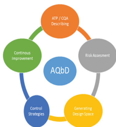
Figure 1. Analytical QbD Flow Diagram.

When we search Procedure Stages schematically;