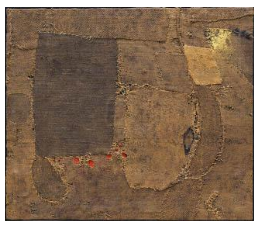
Figure 8. Alberto Burri, Composizione (Composition), Burlap, thread, synthetic polymer paint, gold leaf, and PVA on black fabric, 86 x 100.4 cm. Solomon R. Guggenheim Museum, New York, 1953.

Composizione -Composition- is one of his works from the 1953 Sacchi series. The references to the war that ended recently are clearly seen on the surface of the canvas. Burri uses violence in his work as a means for humanity to accept their irresponsible actions and to remind them of