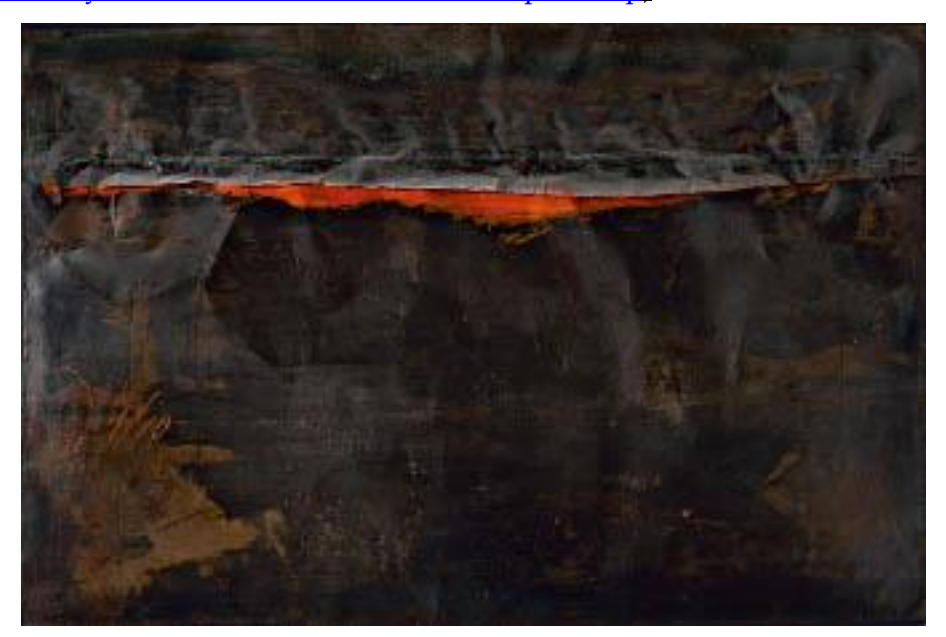
Figure 5. Ferro SP (Iron SP), Welded iron sheet metal, oil, and tacks on wood framework, 130 x 200 cm. Galleria nazionale d'arte moderna e contemporanea, Rome, 1961.(Origin: <a href="https://www.artsy.net/artwork/alberto-burri-ferro-sp-iron-sp">https://www.artsy.net/artwork/alberto-burri-ferro-sp-iron-sp</a>)

When the restructuring period ended in Italy in the 1960s, the country experienced an economic boom. Petrochemical facilities and refineries were set up in North Italy. Daily products such as plastics, Tupperware, packages, and artificial leather started to be produced in factories. In his Combustioni plastica series, Burri experimented with plastic materials and preferred to use oxyacetylene torch instead of the brush as an artistic tool, and instead of canvas, he used plastic, which is durable but fragile at the same time. The artist, who produced his red and transparent works from polyvinyl chloride (PVC) and black works from polyethylene (PE), used some auxiliary materials such as Celotex, acrylic, cloth, thread, vinavil (PVA) in these works.