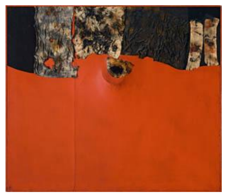
Figure 2. Alberto Burri, Rosso gobbo (Red Hunchback), Acrylic, fabric, Vinavil, and combustion on black fabric; Vinavil can on verso, 86 x 100 cm, Courtesy Galleria Tega, Milan, 1955. (Origin: <a href="http://federicobartoliniartolico.blogspot.com/2016/12/alberto-burri-la-verita-della-materia.html">http://federicobartoliniartolico.blogspot.com/2016/12/alberto-burri-la-verita-della-materia.html</a>)

Burri, who developed different working methods with different materials in order to obtain a variety of textures and embossing on the surface, in his series titled Gobbo -Hunchback-, obtained different bulges on the surface by squeezing tree branches, tin cans, and curved metal bars behind the canvas. In this way, he gave a dimension to the painting plane and pushed it towards the space of the viewer. The artist overturns the Renaissance perspective that the Cubists are trying to disrupt. The perspective now enables the work to expand in the space of the viewer, not as an expansion towards the depths of the space in order to represent a part of the reality in the painting. The hunches that the artist created on the surface can be associated with his research paper in medical school on rachitis and kyphosis -bending of the spinal corddiseases that cause bone deformation. Burri, who produced dark and mysterious holes in the center and-or close to the center of his paintings along with the bulges and dents, used stained, wrinkled, and burnt rags and bandages in different parts of his paintings. On the surface of his works, he created mucus that reminded body fluid, bubbles that imitated the edges of healing wounds, and images that looked like tissues and thin membranes. It can be said that this series which makes disturbing references to the human body makes allusions to the feminist discourses in the 1960s.