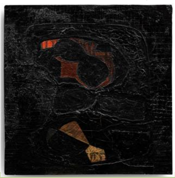
IBAD Sosyal Bilimler Dergisi / IBAD Journal of Social Sciences, (11), 2021