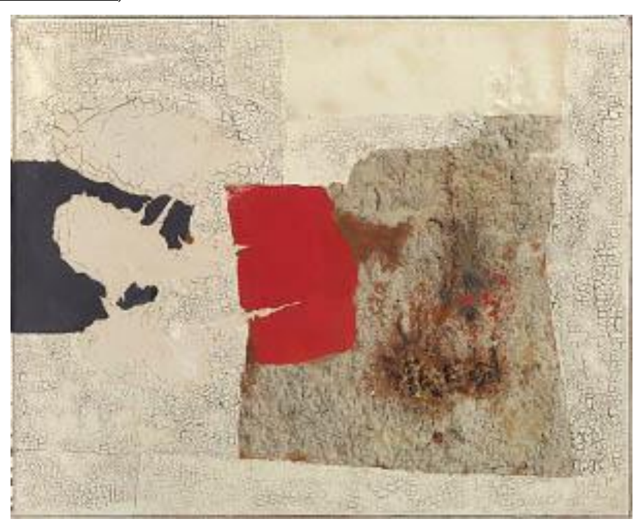
Figure 4. Muffa ( Mold ), Oil, PVA, pumice, sand, and paper on Celotex, 74 x 60 cm. Private collection, London,1952. (Origin: <a href="https://www.amicimuseicastelfranco.it/event/conferenza-oltre-lasuperficie-burri-fontana/">https://www.amicimuseicastelfranco.it/event/conferenza-oltre-lasuperficie-burri-fontana/</a>)